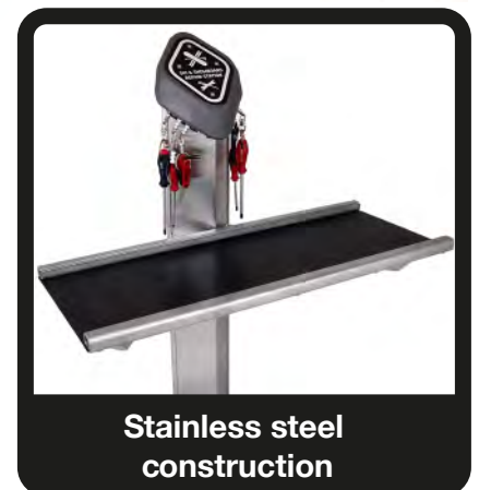
Stainless steel construction