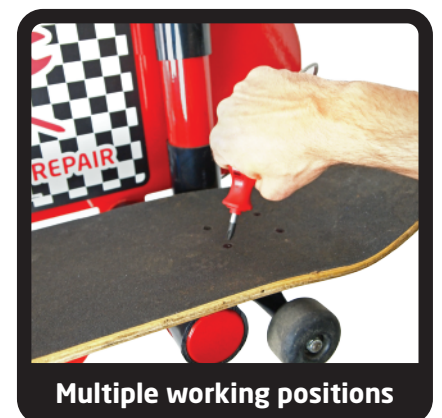
Multiple working positions

Visit www.all4cycling.com.au or call 1300 429 254 for more information