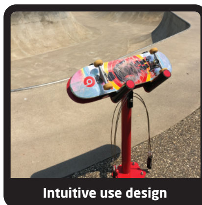
Intuitive use design